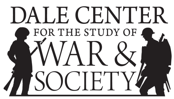
THE UNIVERSITY OF SOUTHERN MISSISSIPPI

The 2016 Waging Peace conference is hosted by the Dale Center for the Study of War & Society at The University of Southern Mississippi.