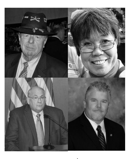
Thursday, September 8 6:30 pm- 7:30 pm Waterbury Ballroom